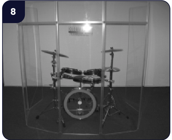
8 With one person on each side, unfold the system and wrap around kit.