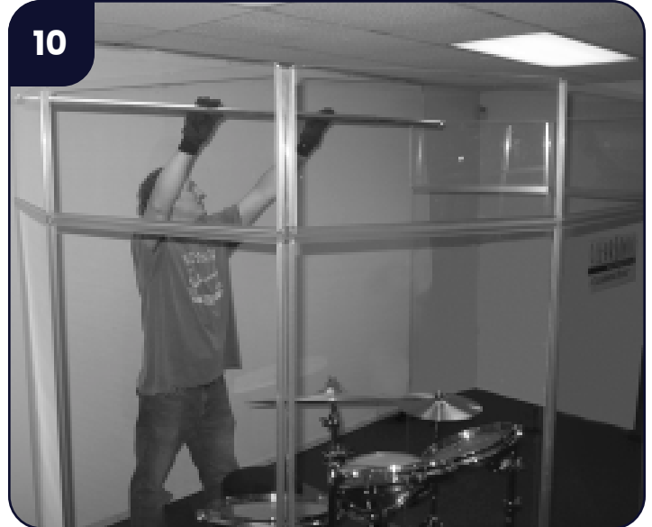
10 Adjust Lid support bar to width between end panels and rest support bar J-hooks at least 4 inches from edge of end shields. Do not extend bar beyond red limit marker. Lid systems wider than 6 feet should use two support bars.