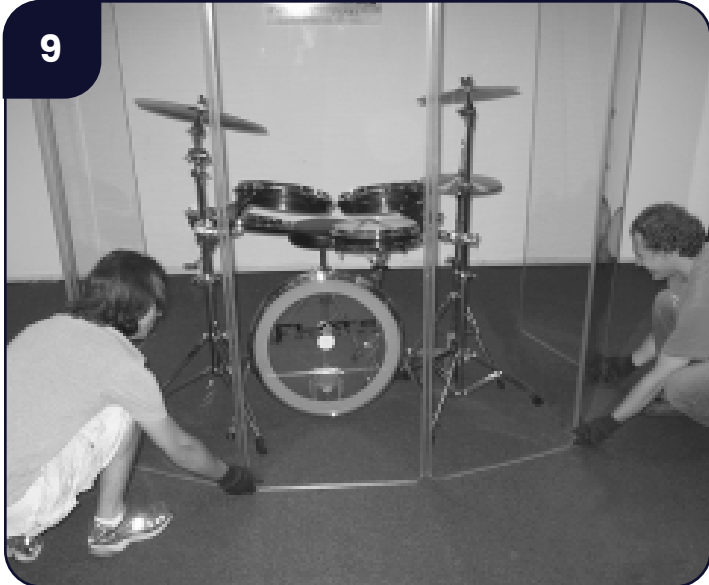
9 Use your fingers to lift the panels at bottom cable cut-outs to pull or push system into final position. End panels should be near parallel and symmetrical on either side of kit, 6–7 feet apart for most applications. Figure 4–5 feet for smaller booths.