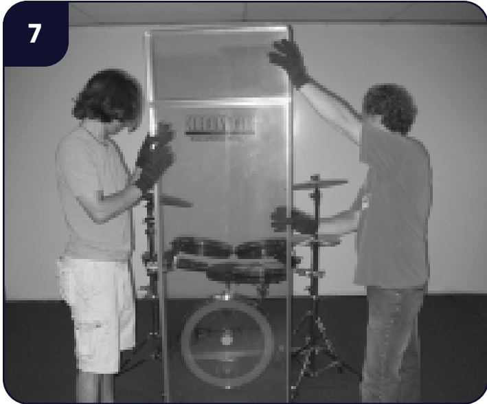
7 Fold up the system and “walk” them to the front center of kit or whatever you’re isolating.