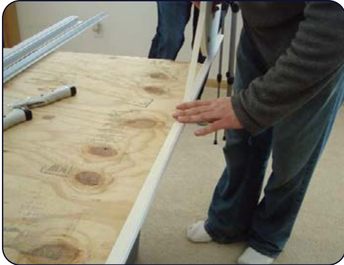
Preparing Angle (if applicable)