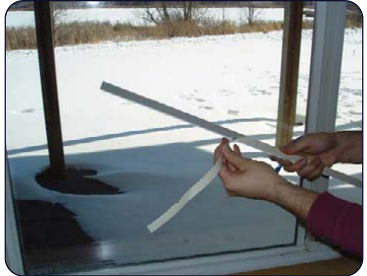
Preparing Angle (if applicable)