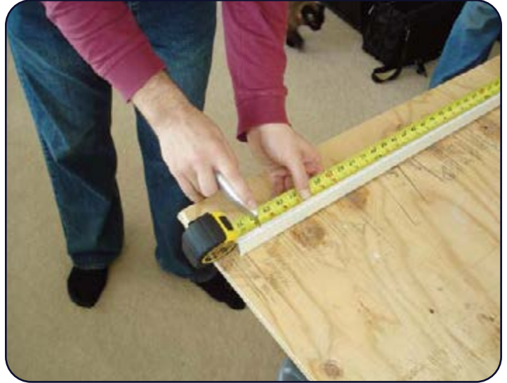
Measuring and Cutting