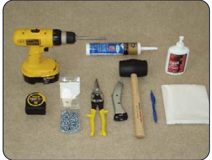
Items Needed for Installation

PLEASE NOTE: Attachment angles may need to be cut to size during installation. Additionally, once the window insert has been dry fit, removing the protective film may require removal of the frame that houses the Plexiglas.