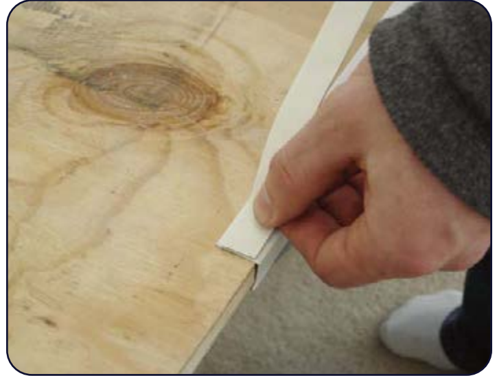
Preparing Angle (if applicable)