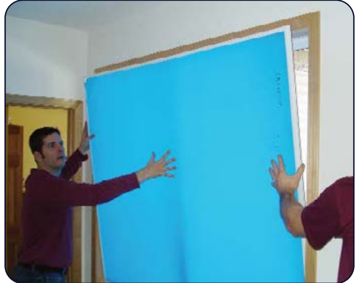
“Dry Fit” of PrivacyShield® Window Seal

PLEASE NOTE: Removing the protective film may require removal of the frame that houses the Plexiglas.