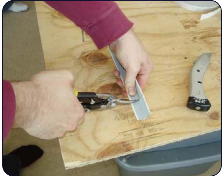
Measuring and Cutting