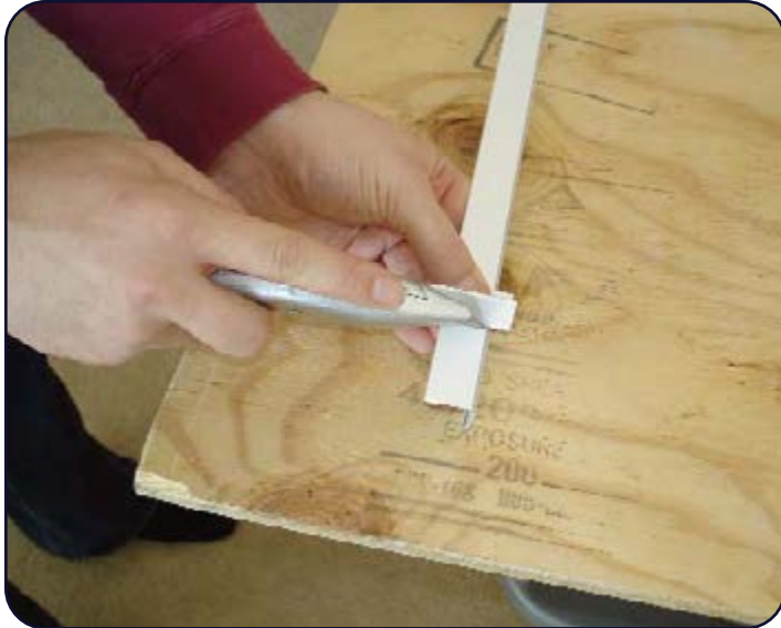
Measuring and Cutting